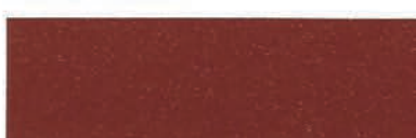
Rustic Red Texture