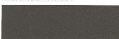
Charcoal Gray Texture